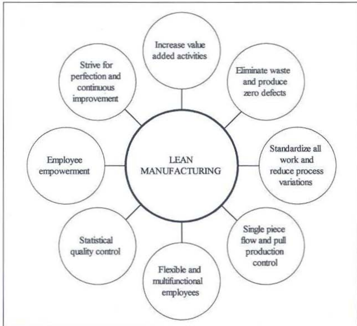
Figure 1. Lean Manufacturing Principles

philosophy of production that emphasizes the minimization of the amount of all the resources (including time) used in the various activities of the enterprise. It involves identifying and eliminating non-value-adding activities in design, production, supply chain management, and dealing with the customers. Lean producers employ teams of multi-skilled workers at all levels of the organization and use highly flexible, increasingly automated machines to produce volumes of products in potentially enormous variety. It contains a set of